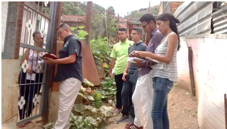
Door to door teaching and distribution of tracts in Venezuela. May, 2019.