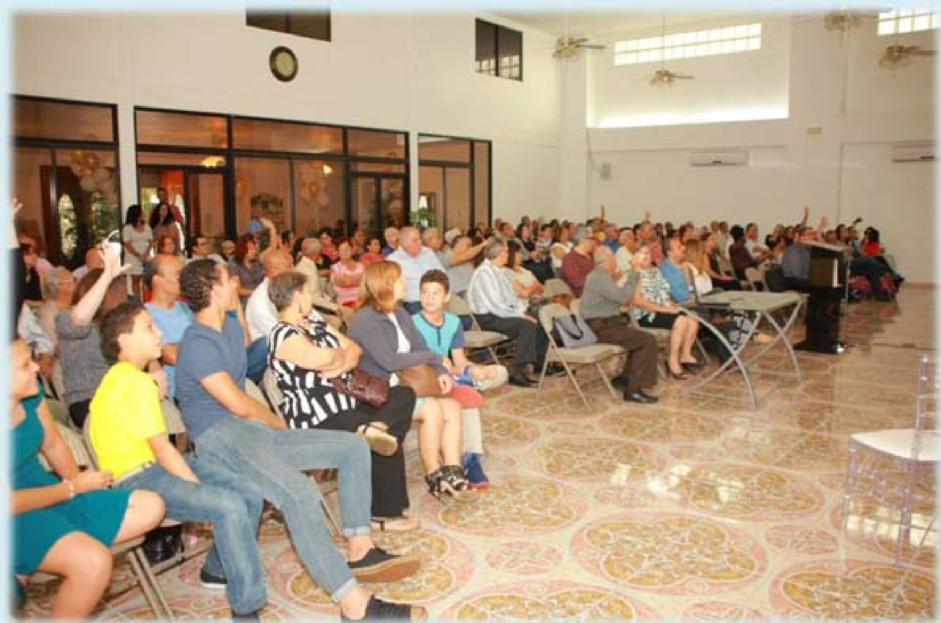
Another view of those present for the event. Entrance to this auditorium is through the spacious lobby behind the tinted glass partition and doors.