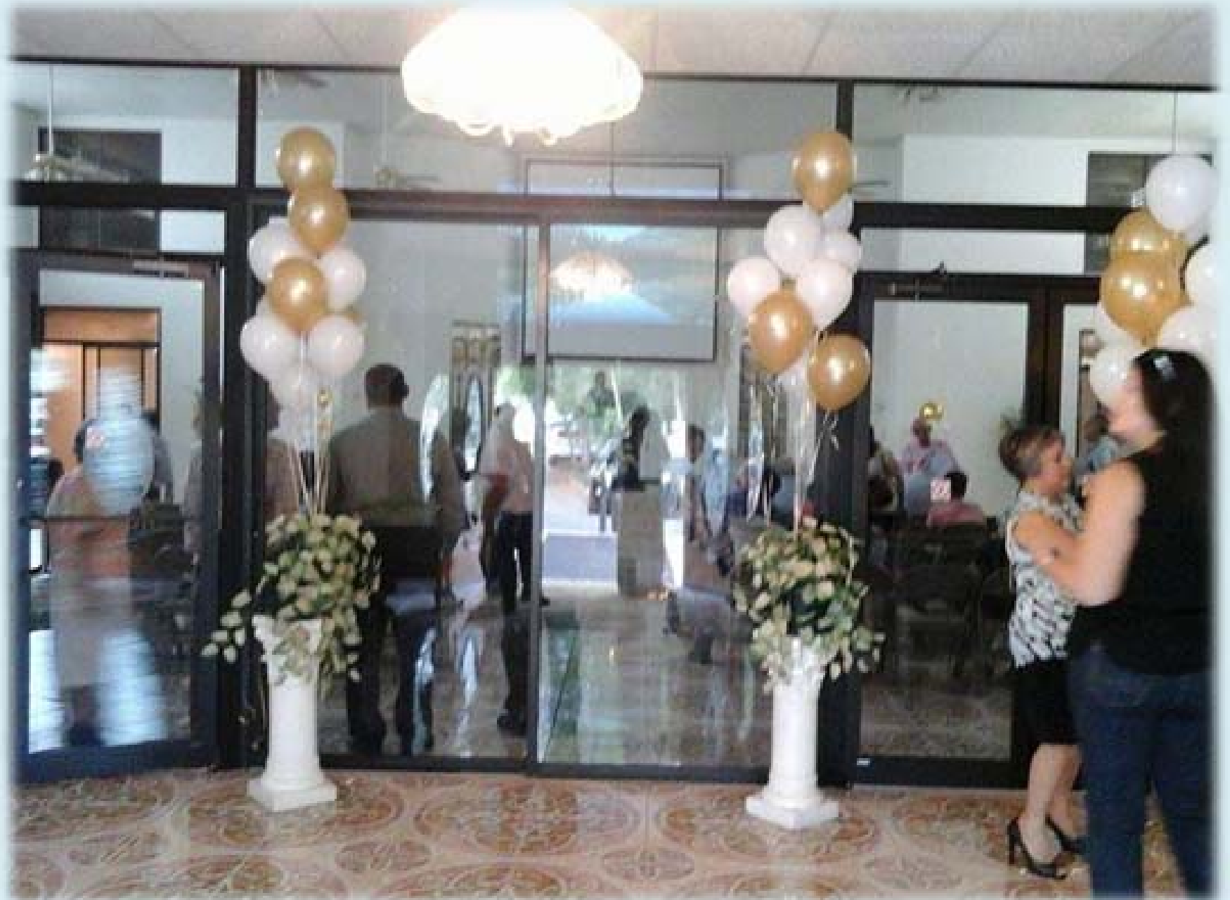
In the Bayamon church building, looking from the vestibule through the tinted glass doors and partitions, into the auditorium. Pleasing decorations all around!