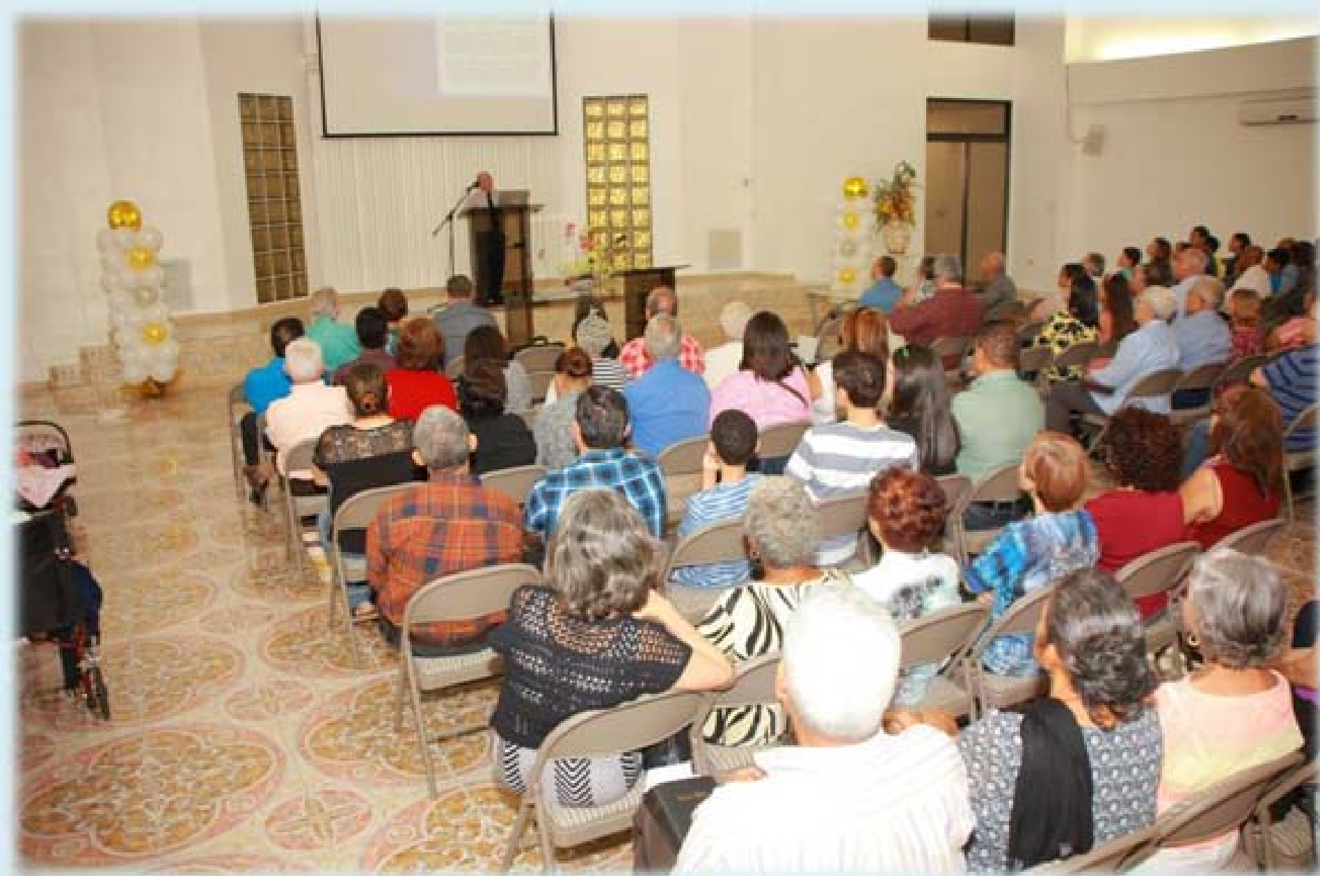
The event was conducted Saturday, April 30, 2016, beginning at 4 pm, in the meeting place of the Bayamon, Puerto Rico church of Christ. It was organized by brethren in Bayamon, with the cooperation of the Gurabo and Cubuy churches.