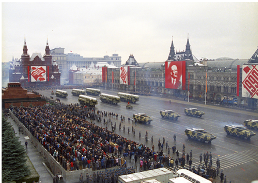
The military might of the USSR on display during an annual parade.

The identity of the seventh king. What earthly kingdom answers to this data on the “ seventh king? ” Reviewing the history of the world after the fall of the Holy Roman Empire in the year 1806, we find a country that appears to fulfill, with amazing exactness, the projections of the prophecy about the “ seventh king, ” to wit: the UNION of SOVIET SOCIALIST REPUBLICS. Let us consider.