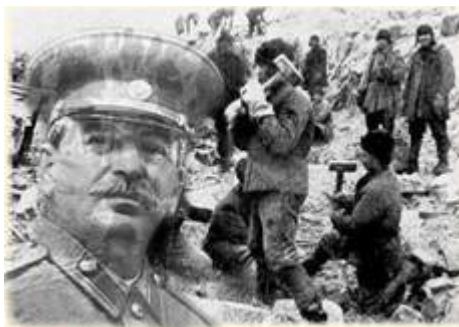
An image of Iósiv Stalin is superimposed on a photograph of a forced labor camp

The government of the Union of Soviet Socialist Republics, having as its vision and guide the radical socialism of the atheist philosopher Karl Marx , author of the famous expression: “Religion is the opiate of the masses,” opposed God, forbidding and even openly persecuting religion in all its manifestations. By acting in that way, it displayed, boldly and shamelessly, the attributes of the great “scarlet beast,” that rises up once and again throughout human history against the true God and human beings that profess faith in him. It turned, at times, up to two thirds of the population of the USSR against the Creator of the universe, and enacted very severe, even brutal, measures against those refusing to deny him, particularly religious leaders, of whom even large numbers suffered martyrdom during certain stages of intense persecution.