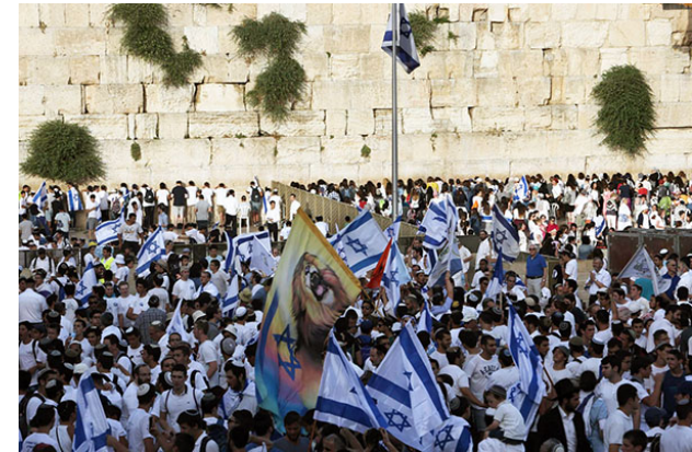
In front of the Wailing Wall, part of the underpinning foundation of Herod’s temple, Jews celebrate the liberation of Jerusalem in June of 1967.

¿Are you aware of them? ¿Are you a part of them? ¿Do you not care? To IGNORE is to risk future DANGERS!